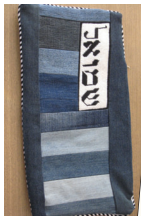
The tallit bag, made from patches from jeans of the entire family